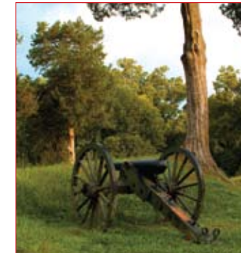
Vicksburg Civil War Campaign