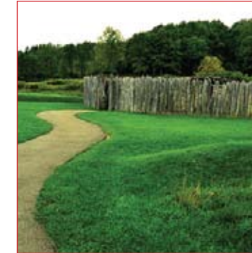
Fort Necessity, Pennsylvania