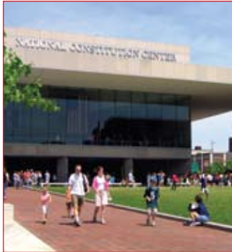
National Constitution Center Philadelphia, PA