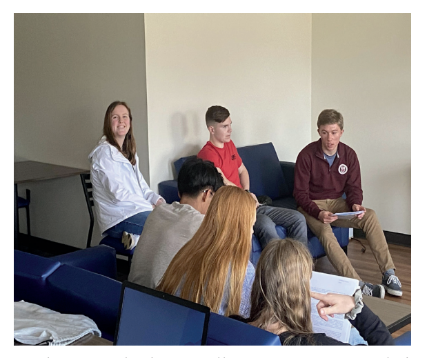
Students worked in small groups to accomplish tasks, learning about leadership and freedoms.