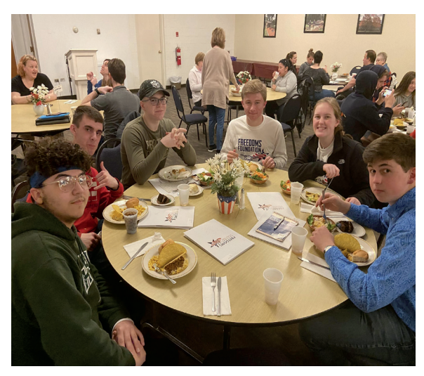
Students met other students from all over the country.