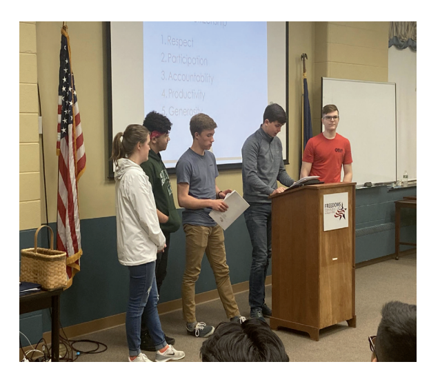
Our students had a chance to speak to the entire conference.