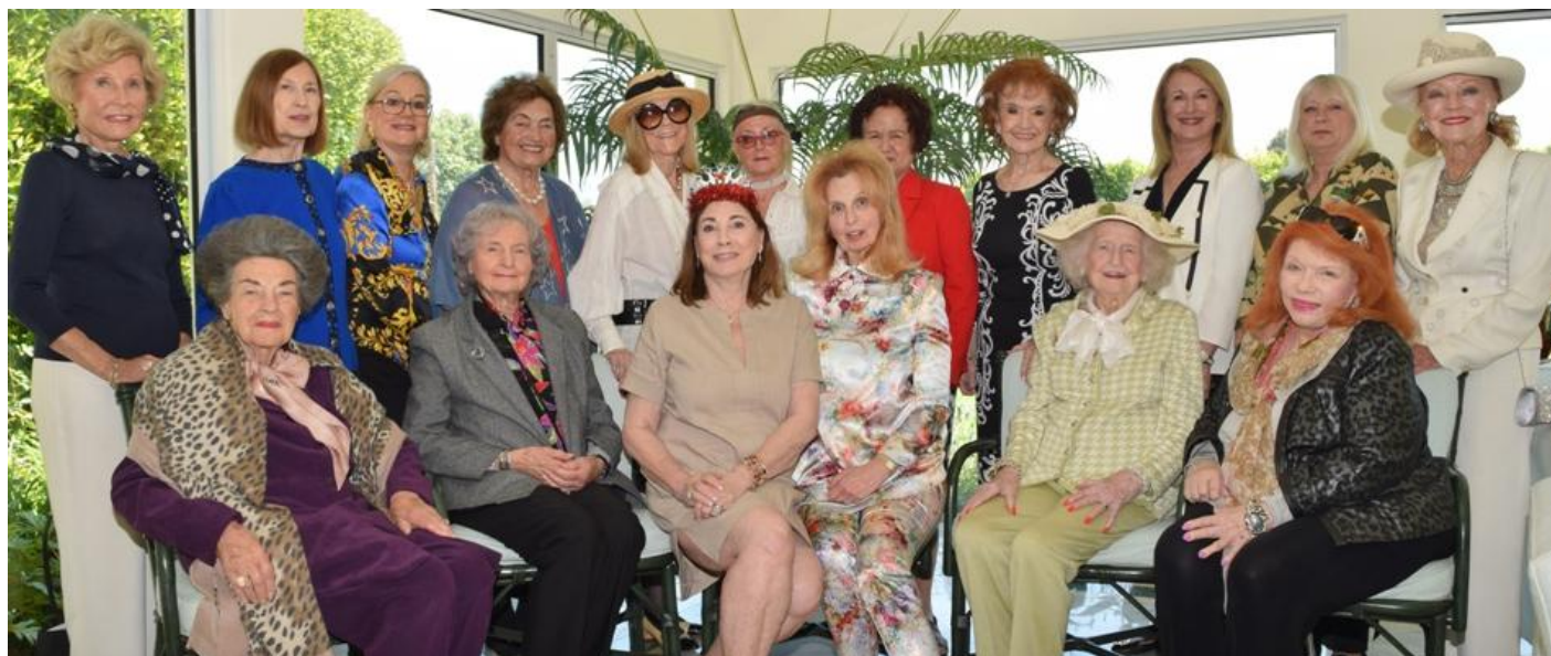
Freedoms Foundation Los Angeles Chapter Board of Directors 2019-2020