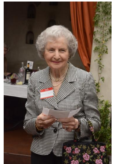
Firefly