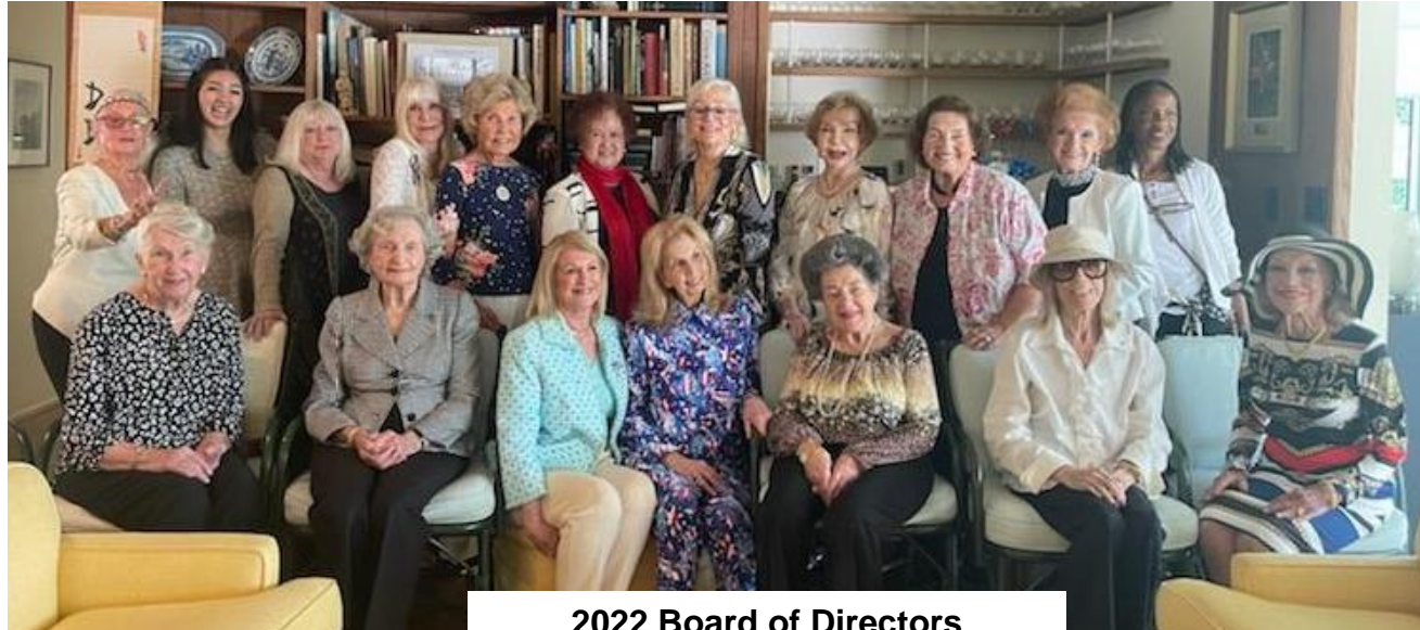
2022 Board of Directors