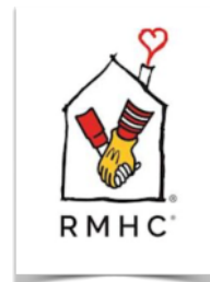
RONALD MCDONALD HOUSE SAN DIEGO