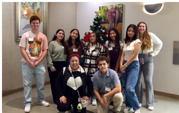
Student Representatives who will attend the "Spirit of America" Leadership Conference at Valley Forge March 9-15, 2023