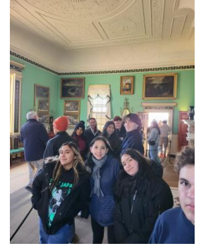
Touring Mt. Vernon