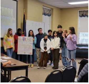
Shark Tank activity