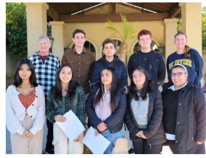
Students are ready to go next week