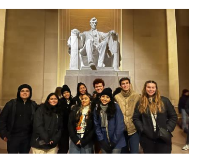
Lincoln Memorial in the evening