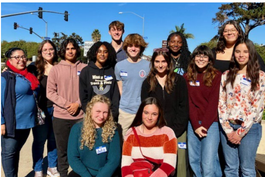
2024 Student Delegates

Please stop and introduce yourselves to him and the young people selected to attend the "Spirit of America" Leadership Program at Valley Forge in the spring. These outstanding students are our leaders of tomorrow.