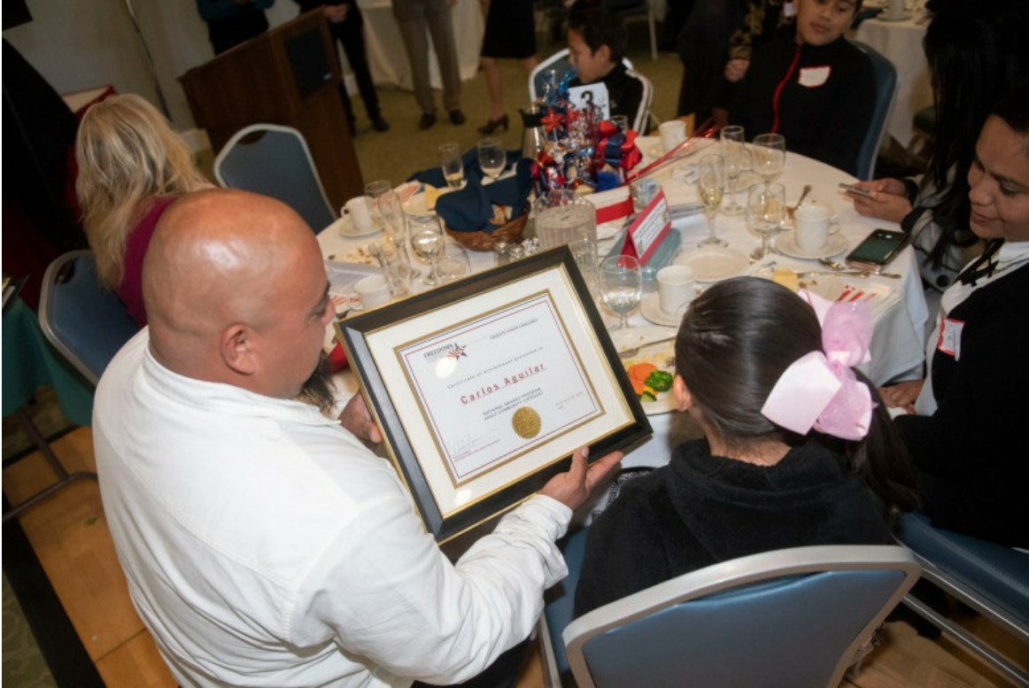
Orange County Awards Ceremony