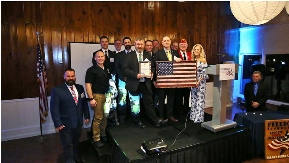
Valley Forge Chapter Awards Ceremony