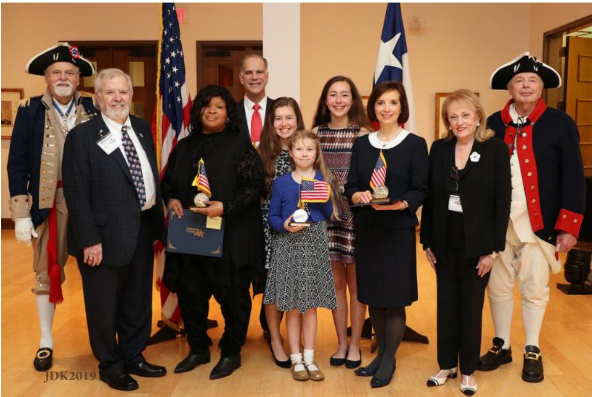
Dallas Chapter Awards Ceremony