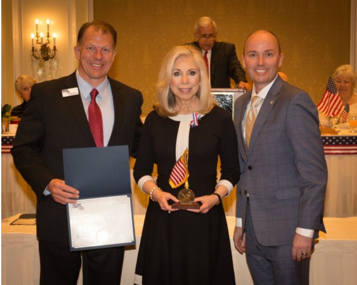
Utah Chapter Awards Ceremony