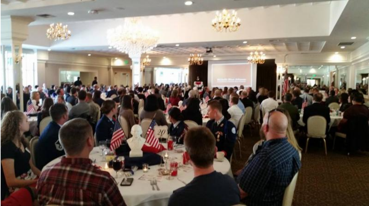
Sacramento Chapter Awards Ceremony