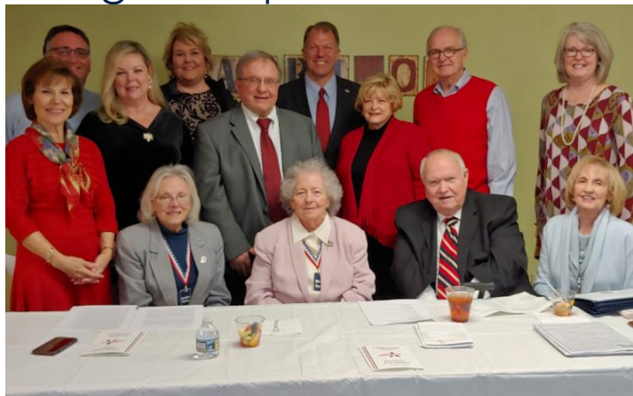
Chattanooga Chapter's Executive Board

The Chattanooga Chapter recently celebrated a milestone, fifty years of service to Freedom Foundation in the greater Chattanooga area. Freedom