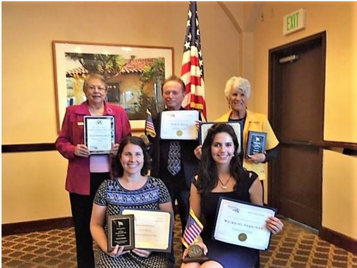
San Diego Chapter Awards Ceremony

Freedoms Foundation's Volunteer Chapters spent the Spring honoring 146 individuals and organizations with the George Washington Honor Medal. Below are a few photo highlights of some of the ceremonies.