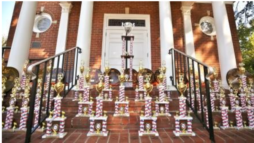
The trophies presented to the winners in various categories.

The Valley Forge Chapter hosted its 2nd Annual Tribute to Veterans Car Show on the campus of Freedoms Foundation on Saturday, September 7. The show included over 100 cars of all makes, models and years. The event also featured local food trucks, vendors, a DJ and activities for the kids. The show was open for the public to attend and view all the incredible autos. Awards were given out in a variety of categories. All funds raised go to support scholarships for Spirit of America and to local veteran organizations.