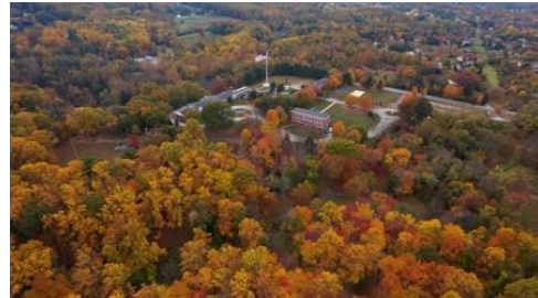
Fall at Freedoms Foundation