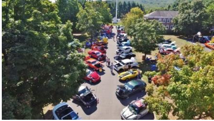
A view of the car show from up above

The Valley Forge Chapter hosted its 2nd Annual Tribute to Veterans Car Show on the campus of Freedoms Foundation on Saturday, September 7. The show included over 100 cars of all makes, models and years. The event also featured local food trucks, vendors, a DJ and activities for the kids. The show was open for the public to attend and view all the incredible autos. Awards were given out in a variety of categories. All funds raised go to support scholarships for Spirit of America and to local veteran organizations.