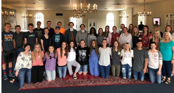
Students from the Utah Chapter with Thomas Jefferson and John Adams at a past Spirit of America program.